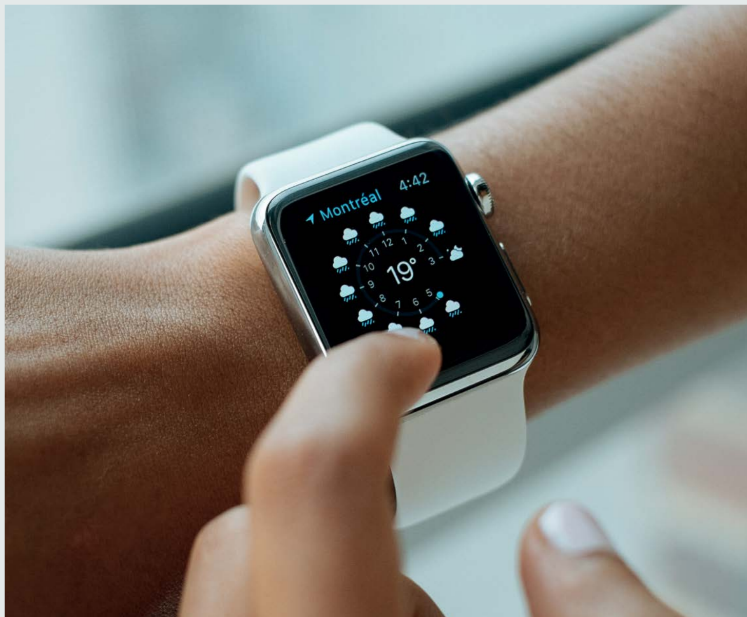
The Apple watch was first released in April 2015.

that have come to be seen as almost natural over the years. And then, there's the man who has designed more watches by volume than anyone else, Marc Newson. Newson played a key role in the design of Apple's Watch, brought on to the project at least in part thanks to his Ikepod venture from which watch designs appeared in the 90s that looked, at first glance, like nothing that had come before (look out for early Hemipode's which are starting to become collectible).