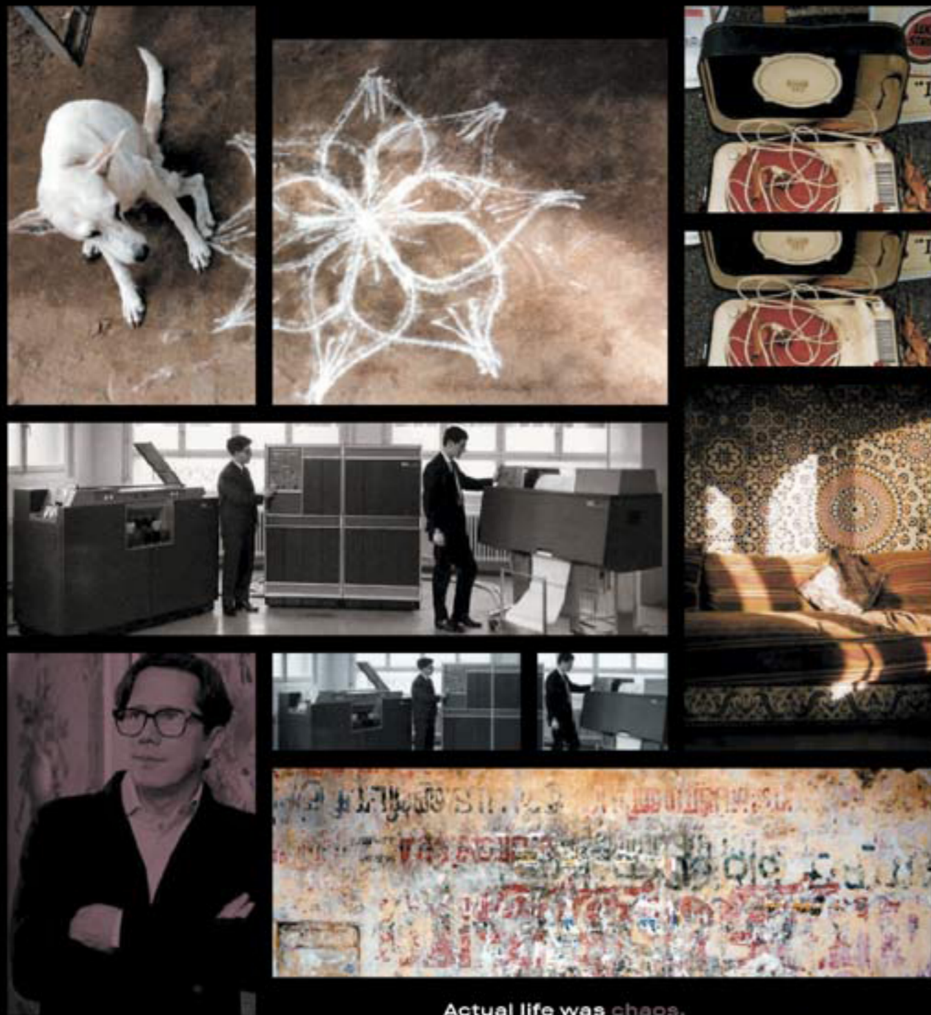
Actual life was chaos, but there was something terribly logical in the imagination. Oscar Wilde